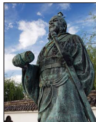
Statue of Sun Tzu in Yurihama, Tottori, Japan

Certainly one reason for Sun Tzu's enduring popularity is that the basic theorems he proposes can be applied to various areas of life and not just war. Building on that, what now follows are excerpts from his 13 chapters.